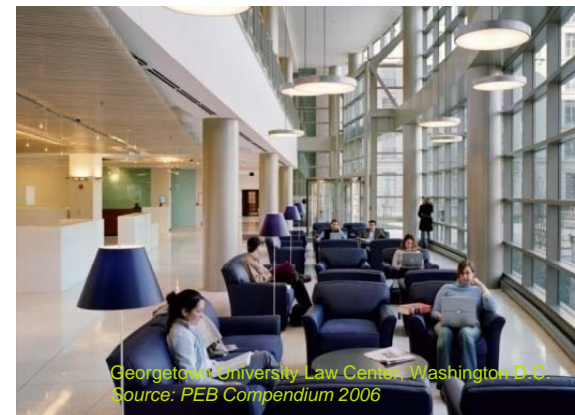
Georgetown University Law Center, Washington, D.C.