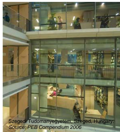
Szeged Tudományegyetem, Szeged, Hungary.