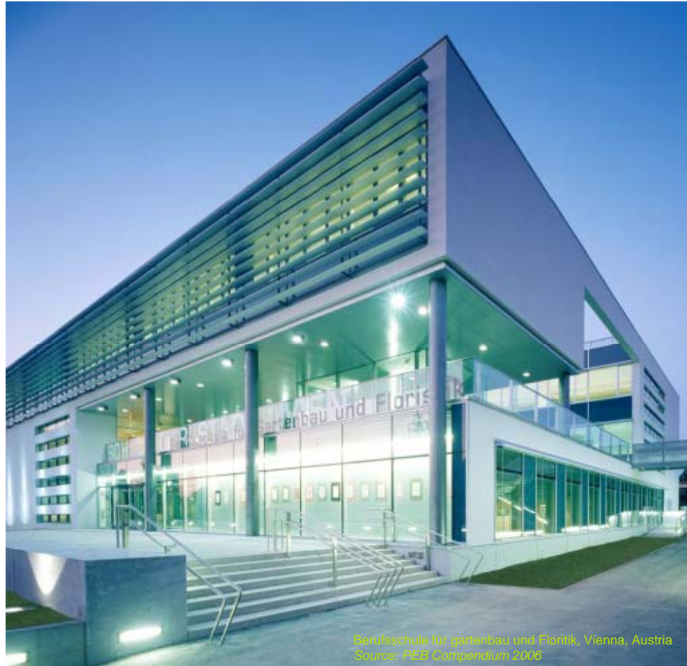
Berufsschule für Gartenbau und Floristik, Vienna, Austria